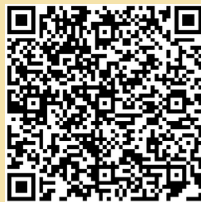
QR Code to Map for Parks

To learn more, please visit the City's website at www.cityofbasehor.org . From the menu, select, "I Want to... Learn About... City Projects... Brighter Basehor: Sales Tax Election 2025."