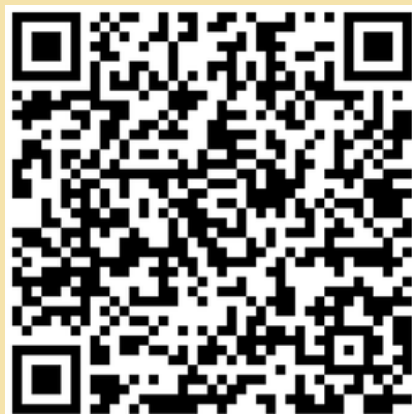
QR Code to Map for Roads