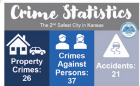
The crime statistics displayed in the graphic are for the second quarter in 2022.

In the next issue of the Basehor Quarterly , we will feature our sponsors for the tournament. Mark your calendars for September 21! We look forward to seeing you there!