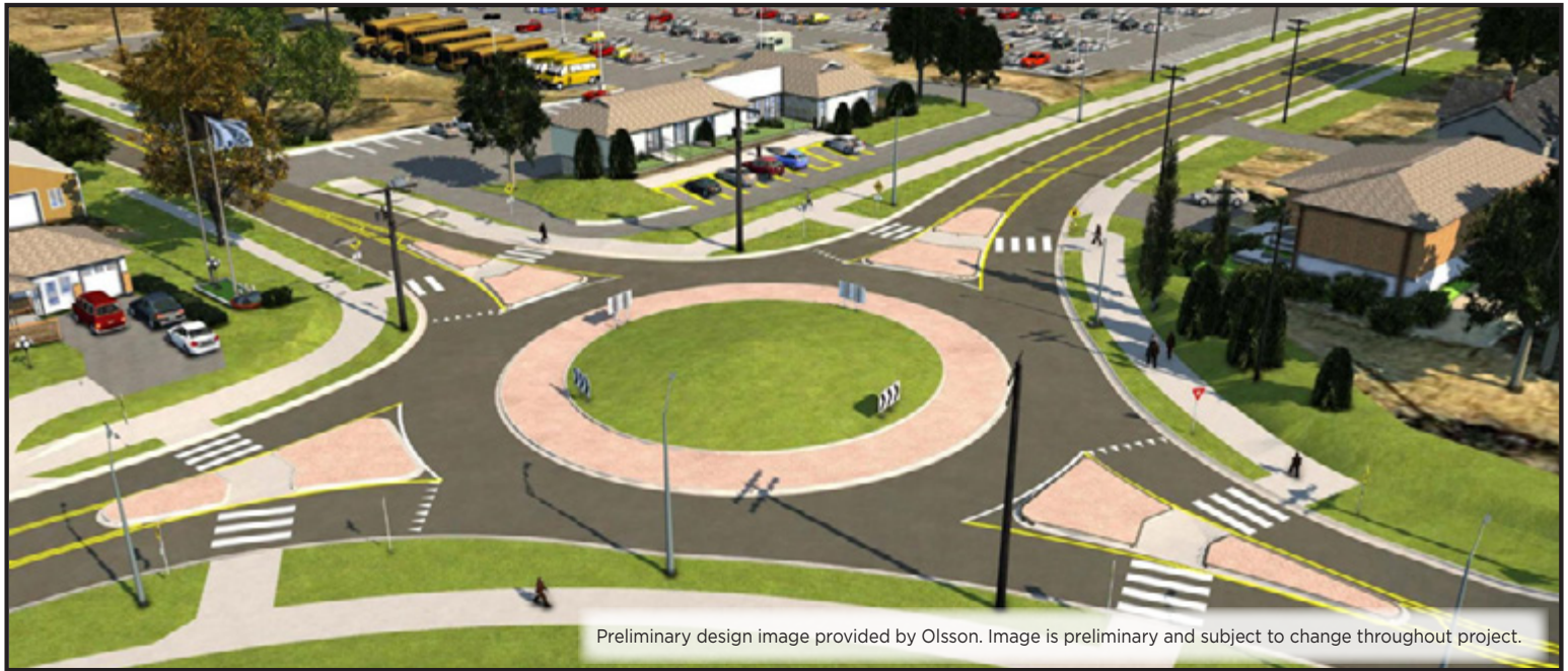
Preliminary design image provided by Olsson. Image is preliminary and subject to change throughout project.